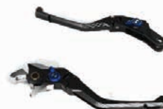
Milled, foldable handbrake lever / clutch lever