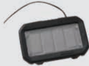
BMW Motorrad smartphone cradle