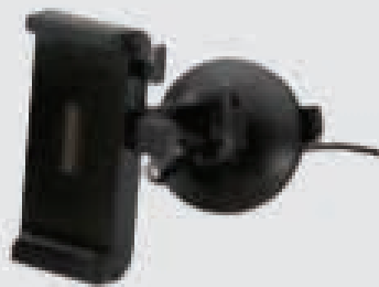
Car kit for BMW Motorrad Navigator VI