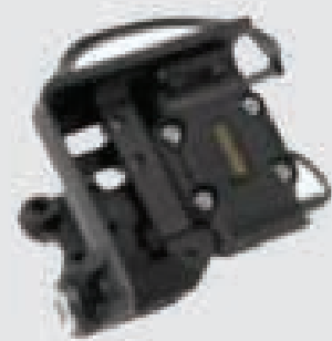
Navigation preparation retrofit set