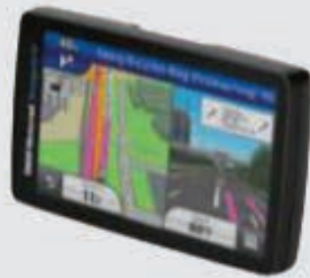
BMW Motorrad Navigator VI