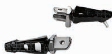
Milled foot pegs